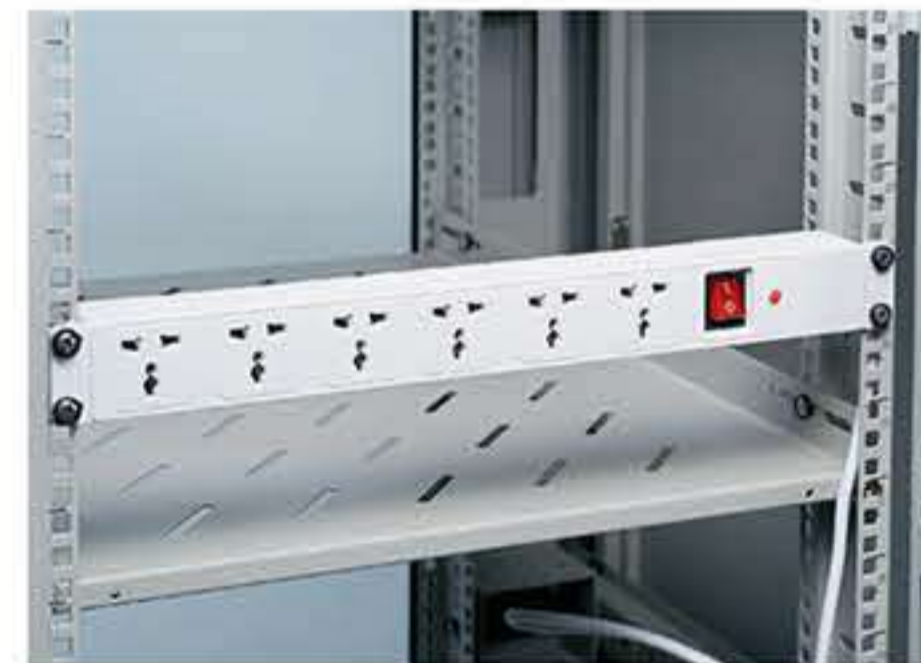
• 6 ways universal PDU