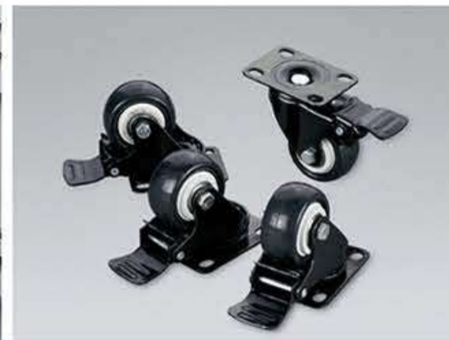
• Castor With Brake